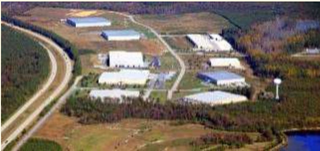
SouthPoint Business Park, Prince George County, VA.

The mission of The Hollingsworth Companies Industrial Building Program is to improve the profitability of our clients' business, while improving the quality of life in our communities by producing high-quality industrial facilities at the lowest achievable cost in the shortest possible time.