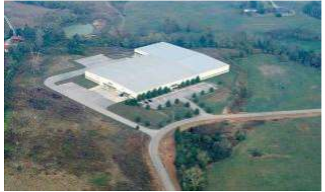
SouthPoint Business Park, Anderson County, TN.

Anderson County, Tennessee is located off of I-75 in Clinton, Tennessee where The Hollingsworth Companies Industrial Building Program began. We have built over twenty projects in Tennessee and always have a variety of facilities to offer. Just like our other SouthPoint Business Park locations, we always keep in stock a Virtually Complete Building and a Pre-graded Lot. Additionally, we have properties that have come off of, or are about to come off of lease, and have been refurbished and are ready for re-leasing at very attractive prices.