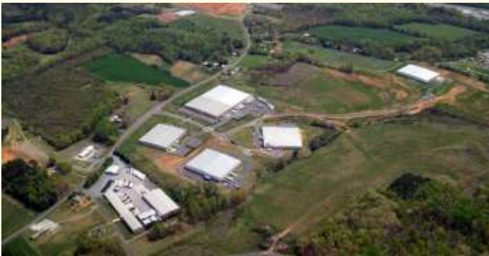
SouthPoint Business Park, Davie County, NC.

"I fully recommend working with The Hollingsworth Companies if cost or time driven schedules play a part in your company's opportunity because they do deliver within budget and on time with no change orders or surprises."