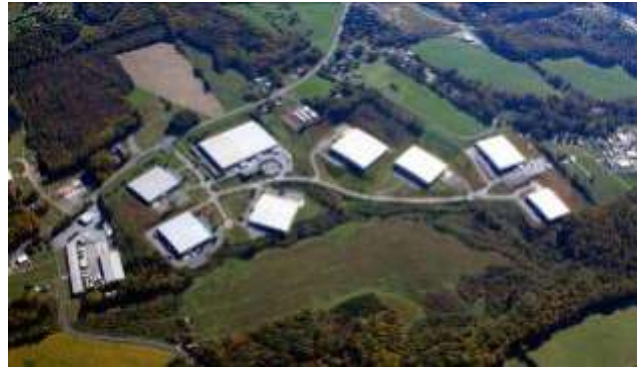
SouthPoint Business Park, Davie County, NC.

SouthPoint Business Park – Davie County, North Carolina, founded by The Hollingsworth Companies has built out Phase I and II are now expanding into Phase III of the development. We have built and delivered 8 buildings while at the same time creating hundreds of new jobs for the community. Our relationship with local and county officials provides an excellent example of how we create and value long term-relationships.