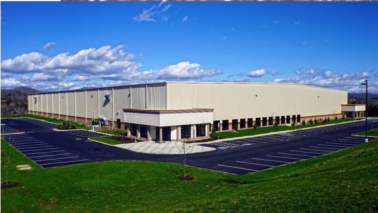
File photo similar Hollingsworth Companies building

CHERRY GLEN BUSINESS PARK MT. PLEASANT, TN