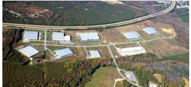
SouthPoint Business Park Prince George County, VA.

SOUTHPOINT Business Park – Prince George County, Virginia , founded by The Hollingsworth Companies in 1997, has been the recipient of the National Associations of Counties award for the “Best Semi-Rural Economic Development Public-Private Partnership in the Nation.