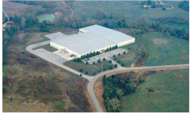
SouthPoint Business Park, Anderson County, TN.

Anderson County, Tennessee is located off of I-75 in Clinton, Tennessee where The Hollingsworth Companies Industrial Building Program began. We have built over twenty projects in Tennessee and always have a variety of facilities to offer. Just like our other SouthPoint Business Park locations, we always keep in stock a Virtually Complete Building and a Pre-graded Lot. Additionally, we have properties that have come off of, or are about to come off of lease, and have been refurbished and are ready for re-leasing at very attractive prices.