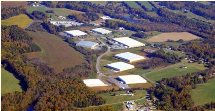
SouthPoint Business Park, Davie County, NC.

"I fully recommend working with The Hollingsworth Companies if cost or time driven schedules play a part in your company's opportunity because they do deliver within budget and on time with no change orders or surprises."