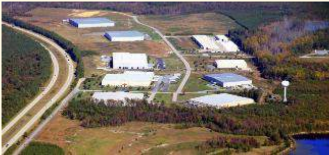
SouthPoint Business Park, Prince George County, VA.

The mission of The Hollingsworth Companies Industrial Building Program is to increase the profitability of our clients' business and improve the quality of life in the community by producing high-quality industrial facilities at the lowest achievable cost in the shortest possible time.