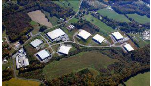
SouthPoint Business Park, Davie County, NC.

SouthPoint Business Park – Davie County, North Carolina, founded by The Hollingsworth Companies has built out Phase I and II are now expanding into Phase III of the development. We have built and delivered 8 buildings while at the same time creating hundreds of new jobs for the community. Our relationship with local and county officials provides an excellent example of how we create and value long term-relationships.