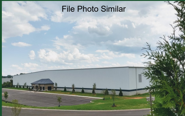
File Photo Similar