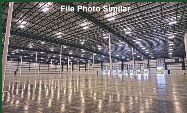
File Photo Similar